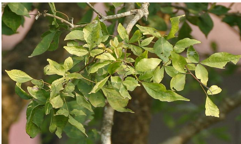
Fig. S1. Leaves of Aegle marmelos