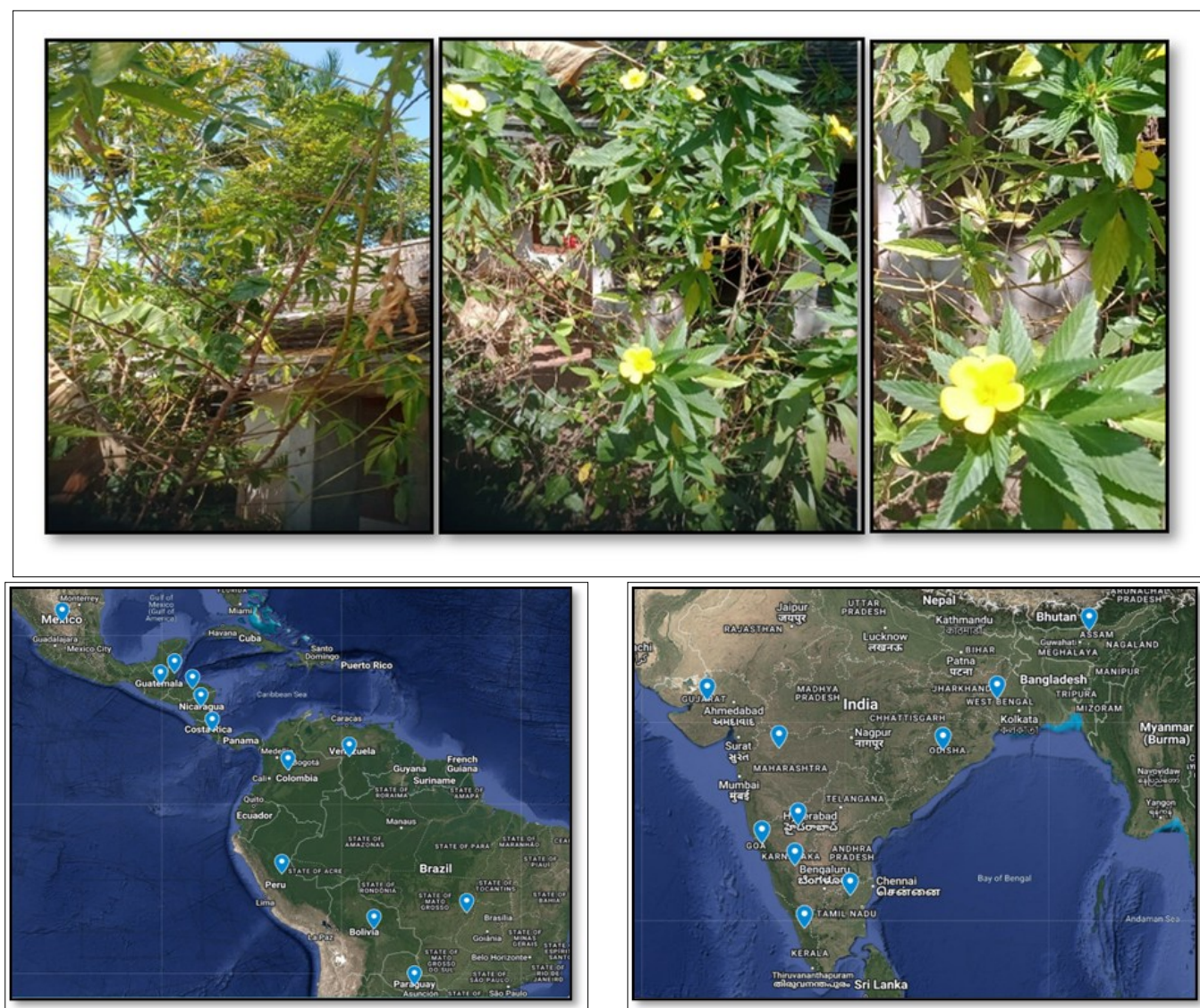
Fig. 1. Morphology of the plant with flowers of T. ulmifolia and its global distribution.

Polyphenols were detected with a ferric chloride test (24). 1 mL of crude extract was mixed with 2 mL of 5 % ferric chloride ( \text{FeCl}_3 ) solution. The mixture was then vortexed or gently swirled to ensure the extract and reagent were adequately mixed. The presence of polyphenols was indicated by a colour shift to blue-green or dark green, with the strength of the colour proportional to the concentration of polyphenols present.