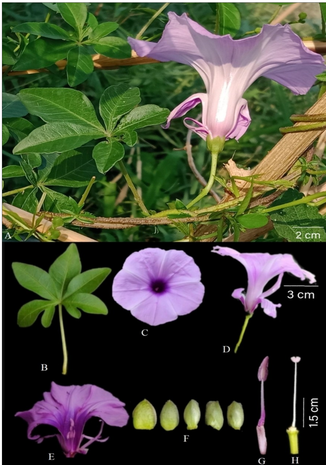
Fig. 2. Ipomoea cairica (L.) Sweet var. appendiculata . (A) habit, (B) single leaf, (C, D) flower - front and side view, (E) flower split open to show androecium, (F) sepals, (G) single stamen and (H) gynoecium.