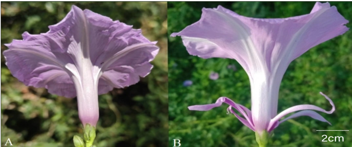
Fig. 1. Flower morphology of Ipomoea cairica . (A) glabrous corolla of I. cairica var. cairica , (B) corolla showing wing like appendages in Ipomoea cairica var. appendiculata .